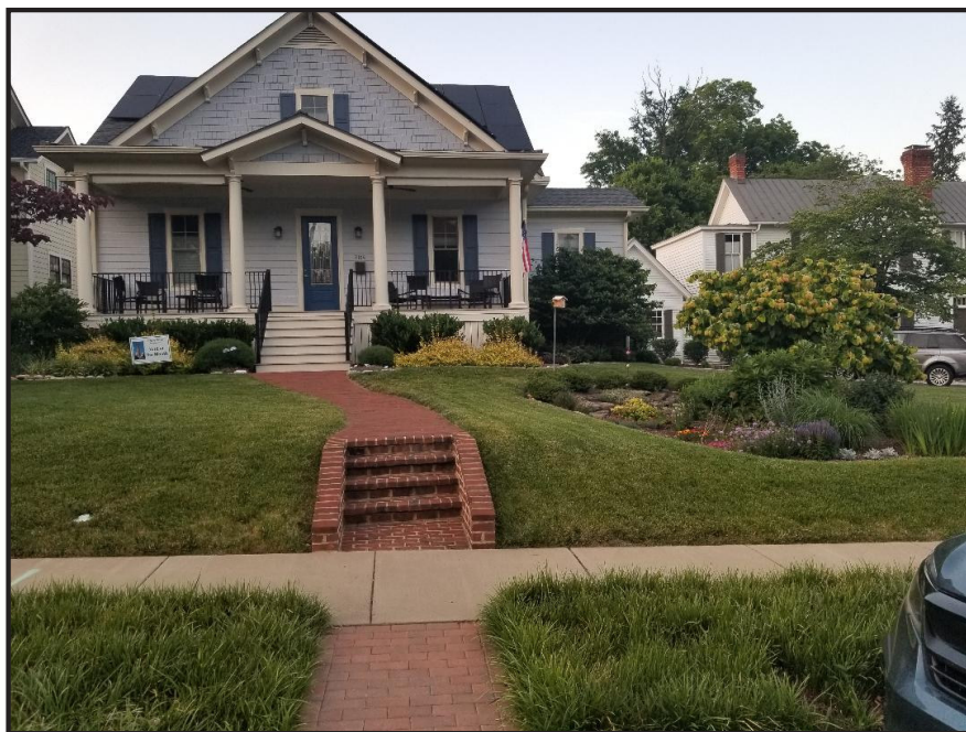
3104 Bute Lane